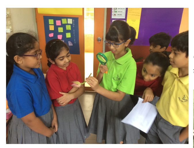
Children made art compositions using materials they picked up from the garden to understand how art can be created from natural objects.

As a provocation for this unit, children observed the features of different habitats such as climate, rainfall, and the plants and animals found there. Here they noticed that plants and animals had different features that helped them adapt in various environments. They also inquired into the developmental changes plants and animals go through their lifetime. Finally they discovered that changes are not only natural but can be man-made too. This sensitised them to the need to protect the environment.