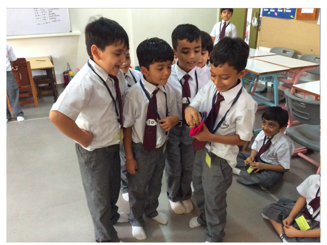
Students listened to the story 'Honesty Pays' and reenacted it to show their understanding.

To tune into this unit, children read, reflected on, and related to various moral stories to understand the concepts of beliefs and values. Next, to practice being respectful, they used a respect checklist and used the golden words "please" and "thank you". They also honed their research and social skills by interviewing the community helpers at school about their roles and responsibilities.