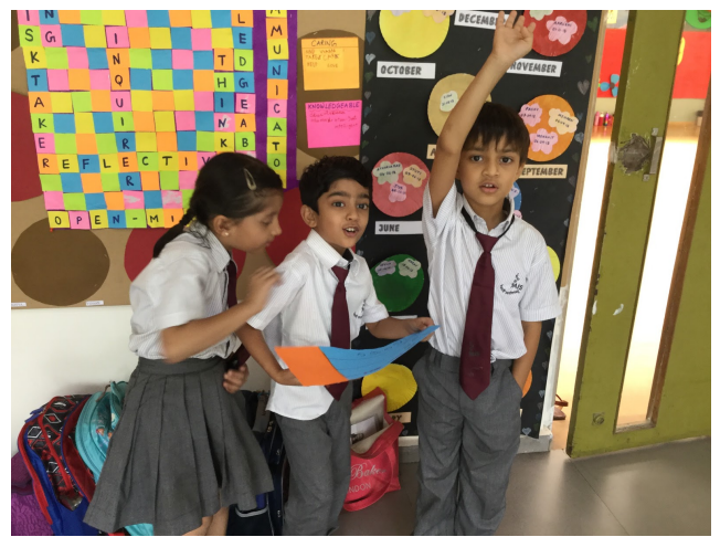
Our young investigators were keenly involved in the value-based survey activity that helped them learn how to use a pictograph.