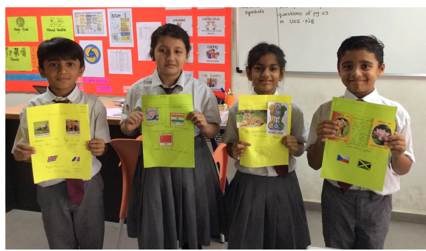
Students practiced the learner profile attribute of international mindedness by inquiring into the national symbols of India and other countries all over the world.