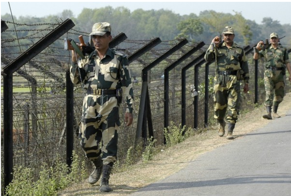
Indian Border Security Force troops patrol the border with Bangladesh in Tripura, 2009