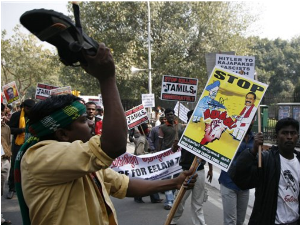
Protesters in Delhi calling on the Indian government to condemn the Sri Lankan offensive against the Tamil Tigers, 2009. The poster shows the Indian Prime Minister and the Sri Lankan President.