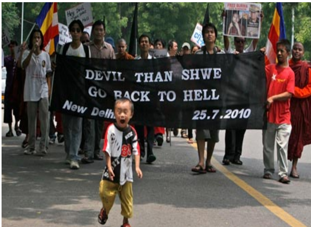
A protest in Delhi during Than Shwe's visit to India, 2010