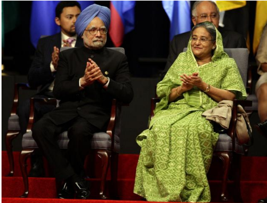
The Prime Minister with the Prime Minister of Bangladesh, 2009

The Resource Bank in India Matters 6 (April 2010) had a focus on India's relationship with China. In this issue, we offer a series of visuals that might be of value when considering India's relationship with other immediate neighbours and India's regional policy in South Asia (both topics in Paper 1 Theme 4).