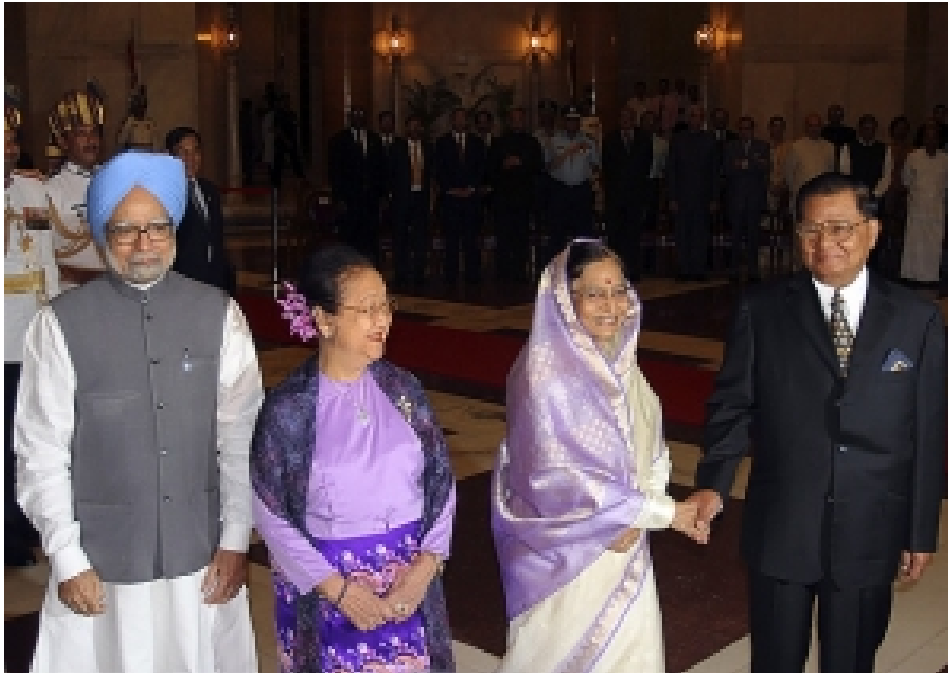
The President and Prime Minister welcome Than Shwe, head of the Burmese junta, to India, 2010