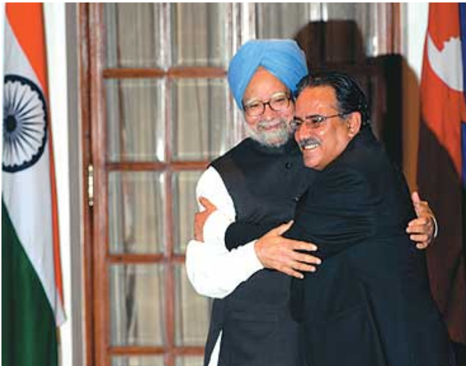
The Prime Minister welcomes the new Maoist Prime Minister of Nepal, Delhi, 2008