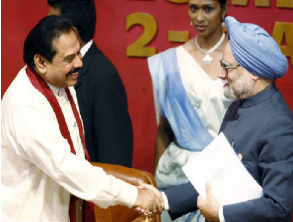
The Prime Minister welcomes the President of Sri Lanka to India, 2010