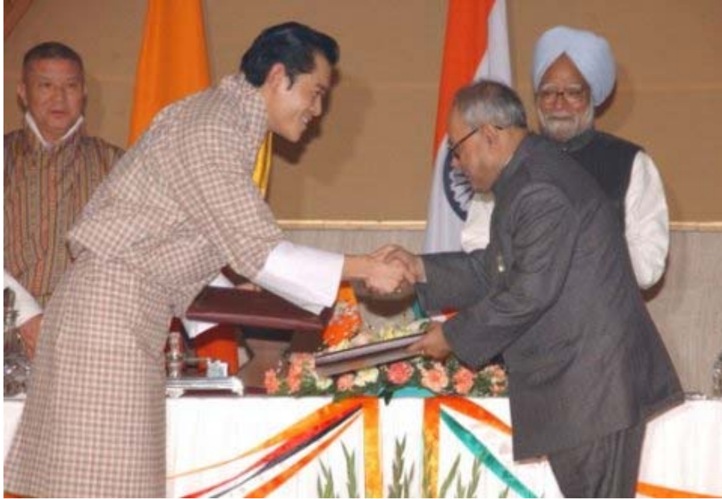
The Prime Minister at the signing of the new Friendship Treaty by the King of Bhutan, Delhi, 2007